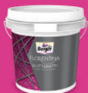
Part B - 20 Kg